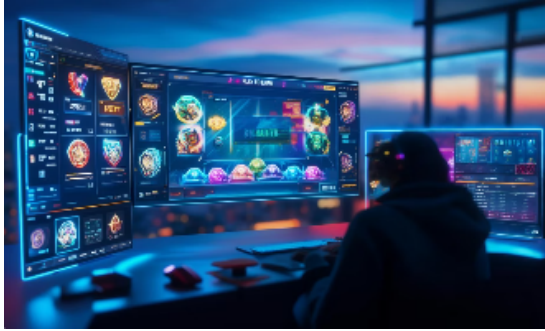
Blockchain Games (P2E)

By launching proprietary NFT games such as the flagship game MotorCity and onboarding external games, Dcosmos attracts players and secures development funds through a GameFi token economy based on user support and investment. This enables the mass production of user-customized games.