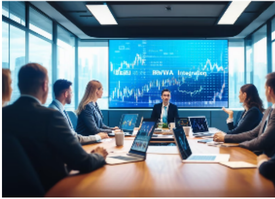
DeFi & RWA Integration

Dcosmos offers DeFi services such as PWR-based staking and liquidity provision, and plans to expand the blockchain economy into the real world by integrating with real-world assets (RWA) in the future.