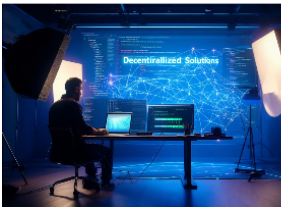
API (Open API)

Dcosmos supports the successful launch of new NFT projects and provides exclusive participation opportunities to PWR holders.