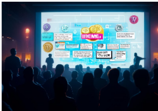
Meme Coin Hub

Dcosmos develops its own AI technologies and integrates with external AI solutions to provide users with differentiated experiences. This can be implemented in various forms, such as in-game AI assistants, AI-based investment/trading analysis tools, and AI creation tools.